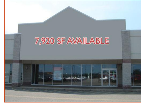
Managed by: PMA Property Management Alternatives, Inc.

Rt. 6 & 108 Washington Towne Blvd. North