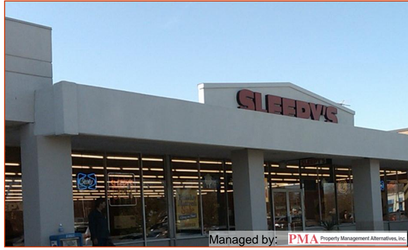
Managed by: PMA Property Management Alternatives, Inc.