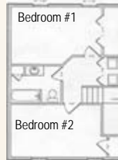
2 nd floor