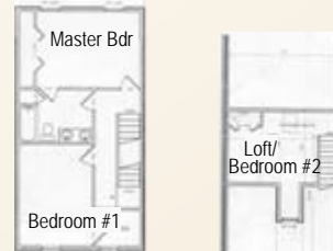
2 nd floor