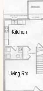
1 st floor