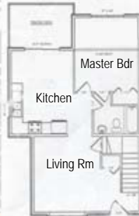
1 st floor

3 bdr, 2 bath 1 st floor Master bedroom, Garage 1,339 SF