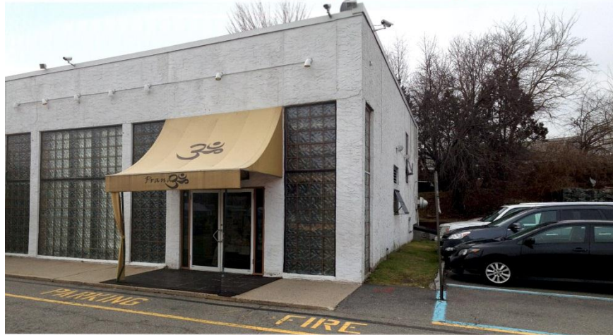
Bloomfield A&P Center | Bloomfield, NJ

2,392 SF Restaurant Opportunity Available